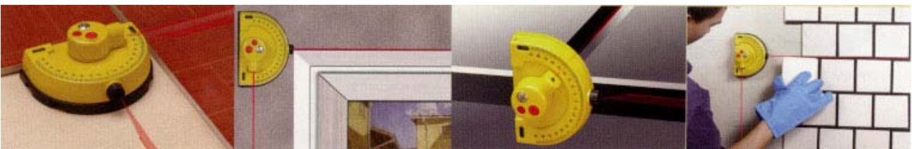
Apply for decoration in House